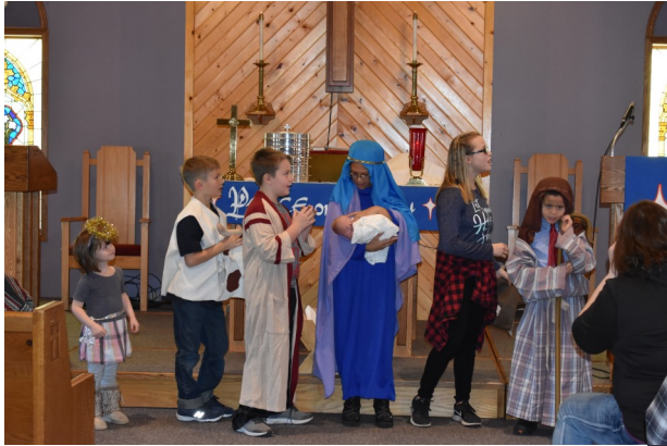
Baby Jesus Song