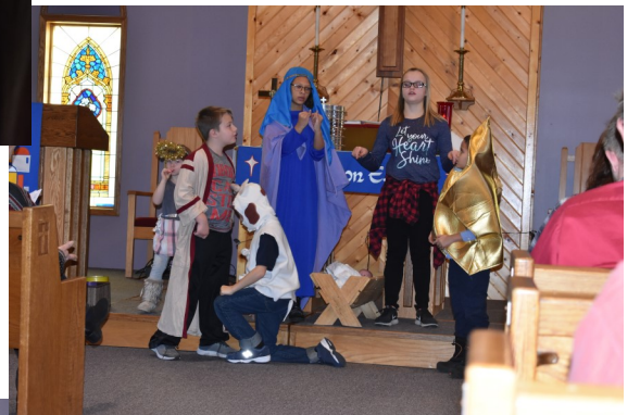
" Away in a Manger"