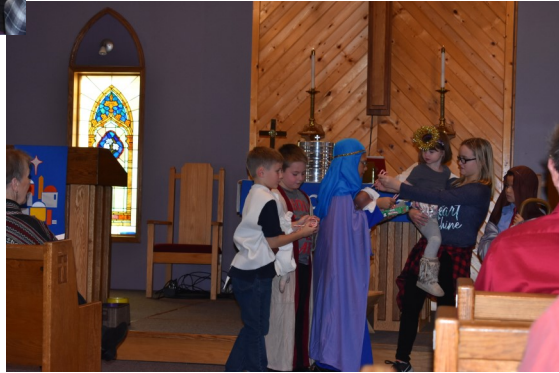
Candy Cane story