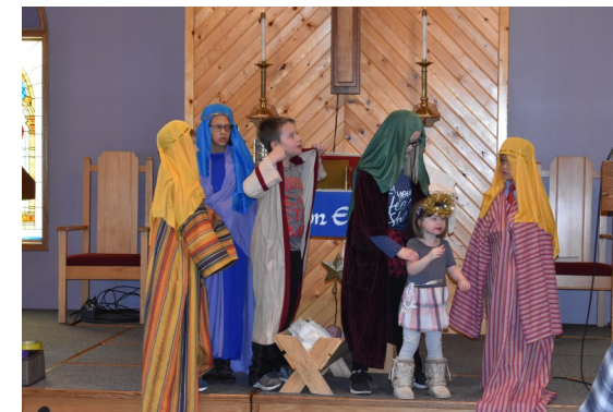
" Do You Hear What I Hear?"