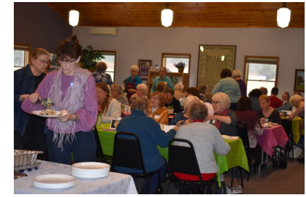
A delicious lunch was enjoyed by our WELCA sisters.