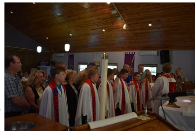
Bone Lake Lutherans' newest voting Members.