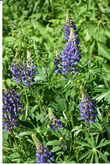
The lupines are beautiful at Mickey Vilstrup's house