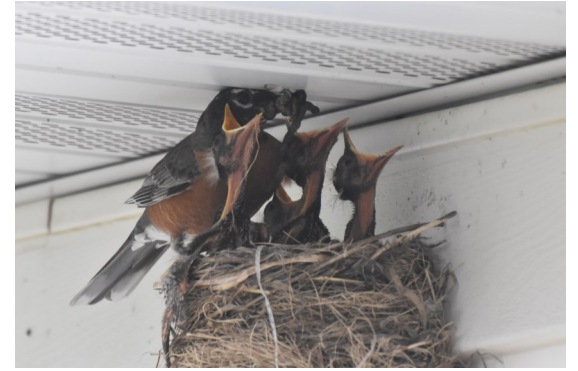
PICTURE #1 Most birds are busy with families like the church kitchen door robin. PICTURE #2 The baby robins are growing fast. They have opened their eyes and are replacing the baby down with some feathers. They are always hungry.