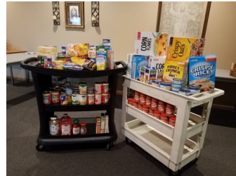
Food shelf food that was donated.