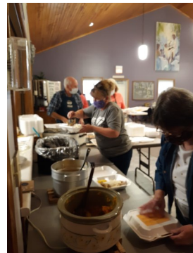
Dishing Up crew