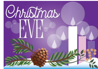
Virtual Christmas Eve Service at 7:00pm