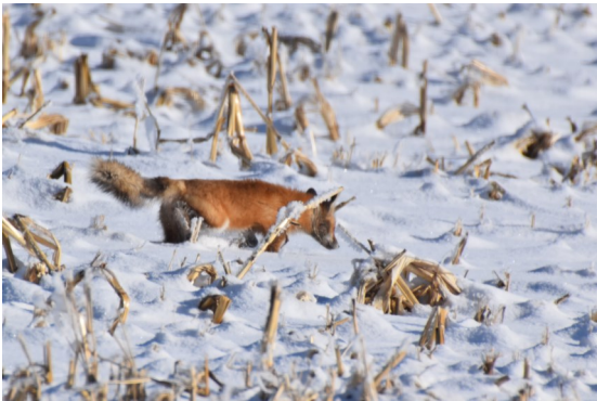
This beautiful red fox is looking for Lunch in the cornfield.

There will be no quarterly meetings until Church opens back up or we need a meeting and a safe way will be decided on. There will also be no Apple River Conference Spring Day of Renewal in April per the board meeting held on Jan. 23, 2021.