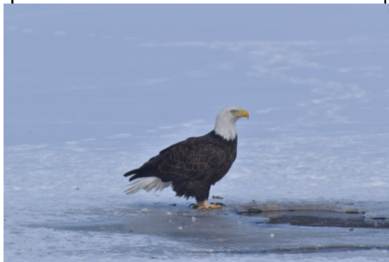
It has been warm enough that some ponds are opening up enough for eagles to drink.

February 17th is Ash Wednesday, and there will be a Drive-up service at 7pm . Lenten Services will be drive-up or Facebook Live on Wednesdays at 7pm.