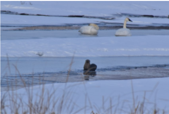
An otter and some of the swans on Straight River near Bill Schilling's.