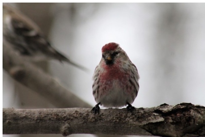
Red polls have come south enough to see some here.