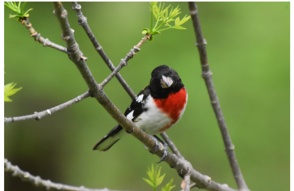
Rose breasted grosbeak