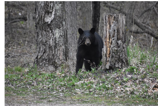
Pesky yearling black bear