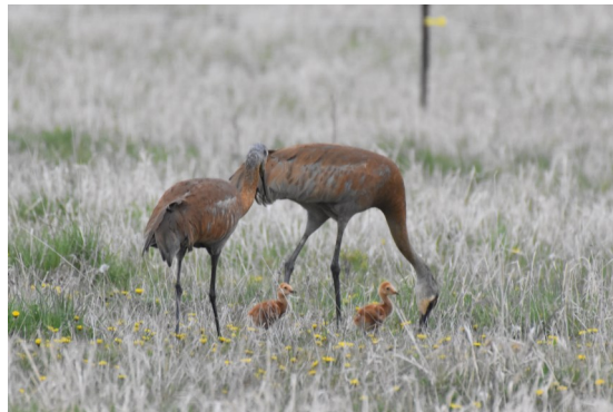
Sandhill crane family