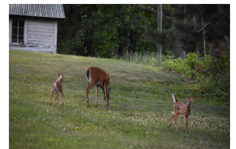
First fawns of the summer.