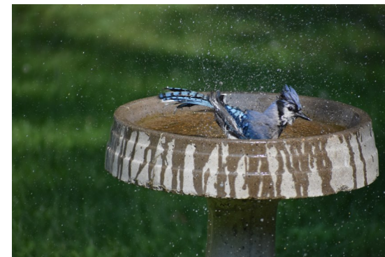
Blue jays like to cool off too!