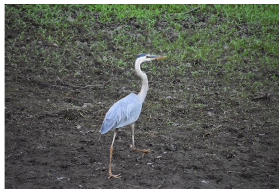
Lack of water makes it harder for the blue heron to fish.