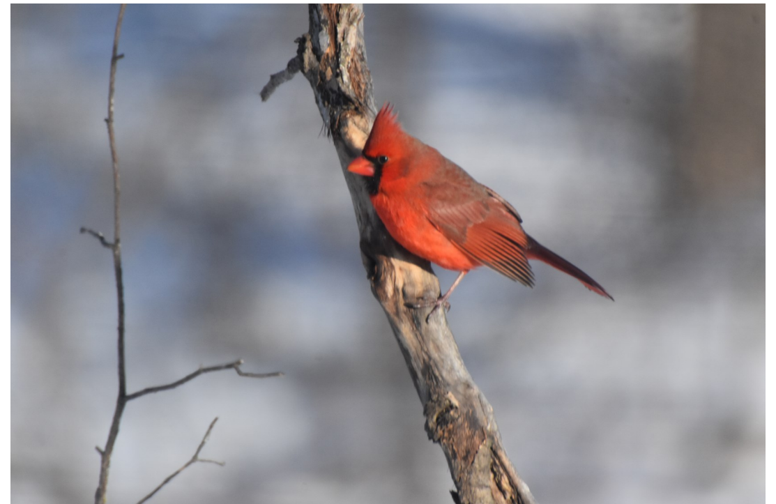
Northern Cardinal in the evening sun.