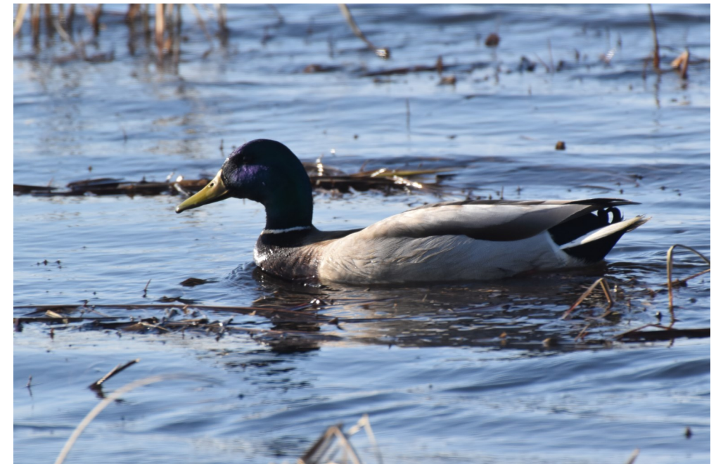
Mallards have returned to nest