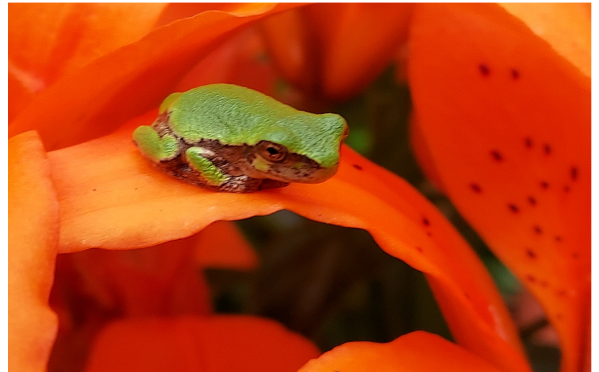
This small tree frog shows up nicely sitting on a open orange lily.