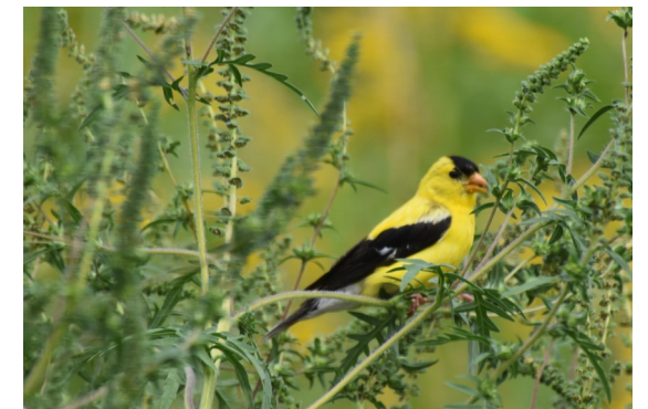
American Goldfinches raising their young. Seeds here to feed them.