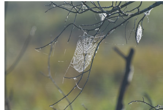
Morning cobwebs before the sun evaporated the dew.