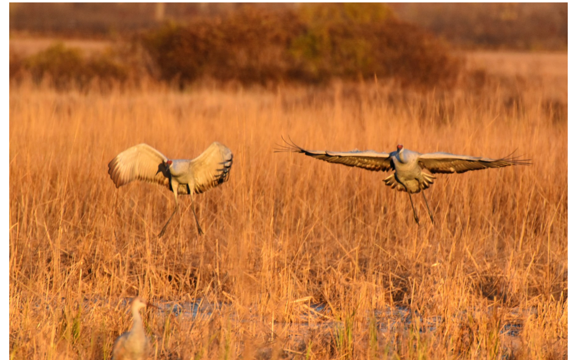
Sandhill Cranes are gathering to fly south