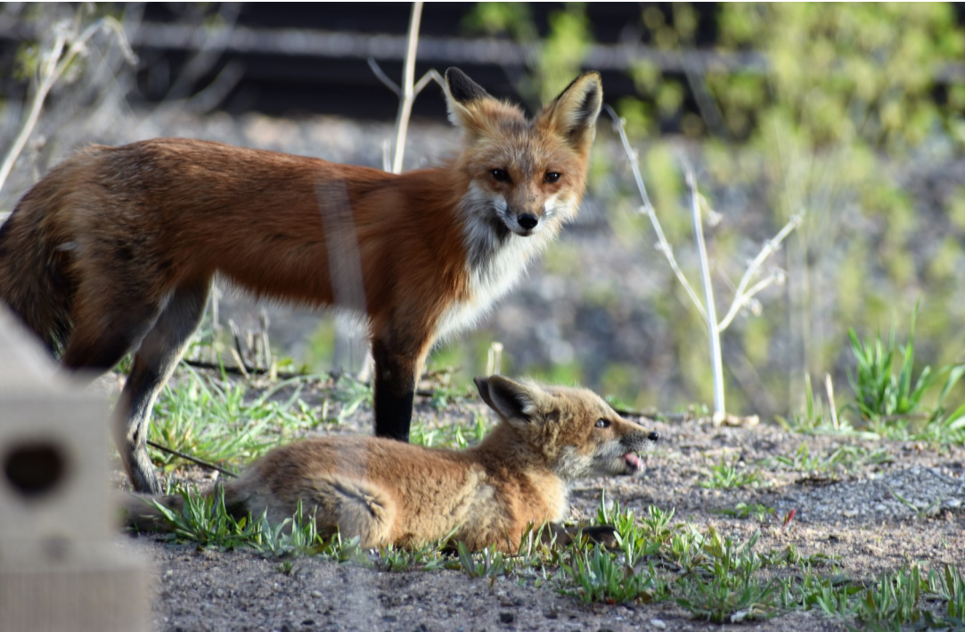
Female Red Fox watching me taking her pictures and watching her young kit.