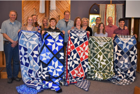
Our seniors and their proud parents.