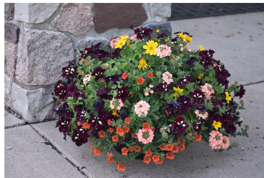
Beautiful flowers by the church front door.