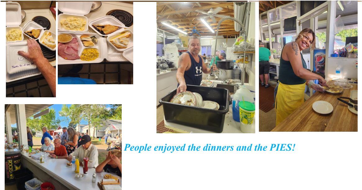
People enjoyed the dinners and the PIES!